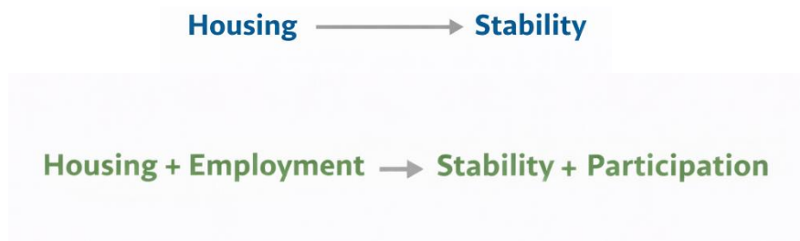
Figure 1: Traditional Model vs Homes With Heart Model

Without structured daily work, even the most stable housing environments can unintentionally lead to isolation. Adults with IDD frequently lose the routine, social connection, and purpose that school once provided. Families who have fought for years to secure stability are left asking the same question: What comes next?