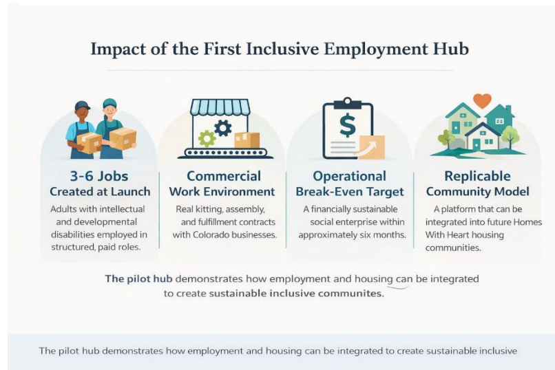
Figure 5: Impact of the First Employment Hub

Initial contributions help fund the practical elements required to begin operations, including: