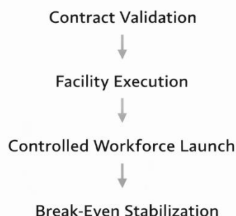
Figure 2: Pilot Launch Framework

Once stabilized, the model becomes replicable.